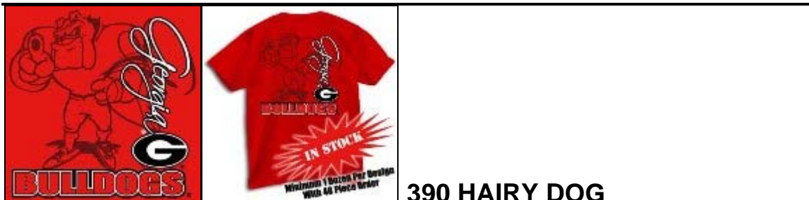
390 HAIRY DOG

UGA 389 L-S SM QUANTITY: 6 12 24 36 48 96 L-S SM UGA 389 UGA 389 L-S MED QUANTITY: 6 12 24 36 48 96 L-S MD UGA 389 UGA 389 L-S LG QUANTITY: 6 12 24 36 48 96 L-S LG UGA 389 UGA 389 L-S XL QUANTITY: 6 12 24 36 48 96 L-S XL UGA 389 UGA 389 L-S *2X QUANTITY: 6 12 24 36 48 96 L-S *2X UGA 389 UGA 389 L-S *3XL QUANTITY: 6 12 24 36 48 96 L-S *3X UGA 389